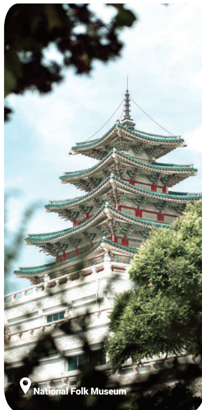
National Folk Museum