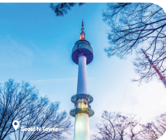
Seoul N Tower