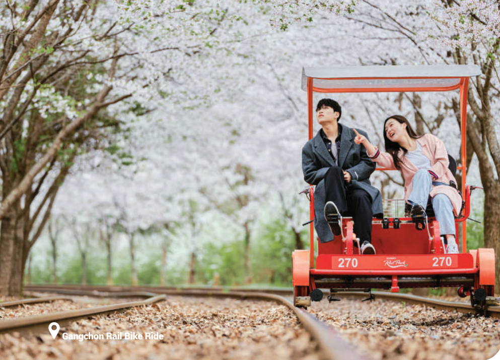
Gangchon Rail Bike Ride