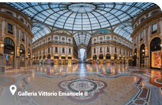
Galleria Vittorio Emanuele II

Notes: The itinerary may be subject to change due to unforeseen circumstances and without prior notice.