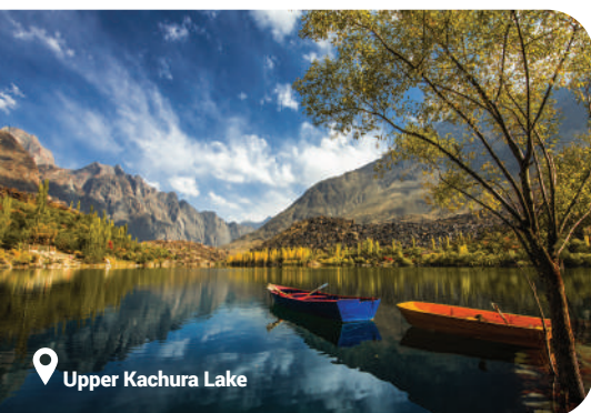
Upper Kachura Lake