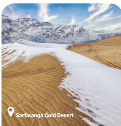
Sarfaranga Cold Desert