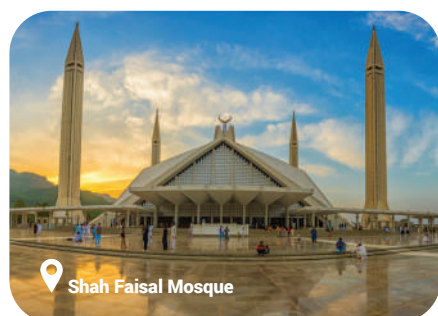
Shah Faisal Mosque