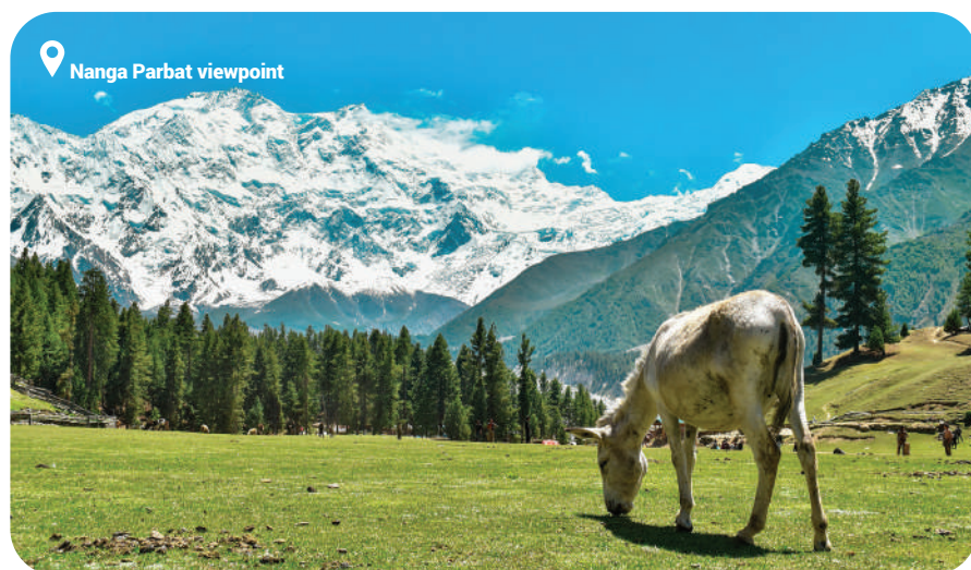
Nanga Parbat viewpoint