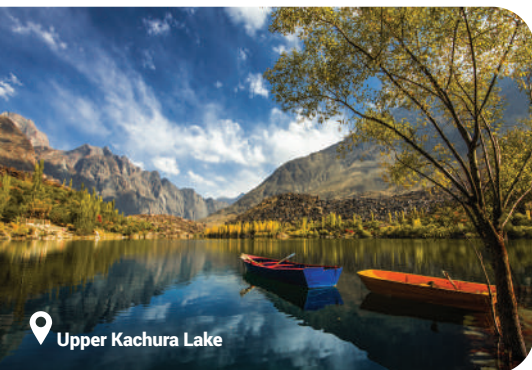
Upper Kachura Lake