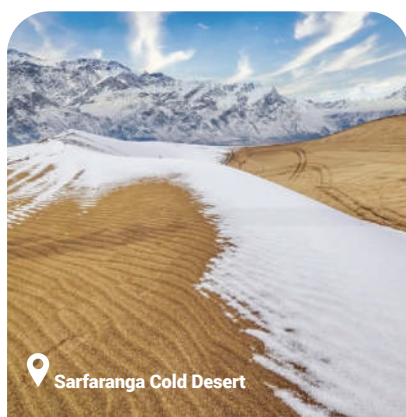
Sarfaranga Cold Desert