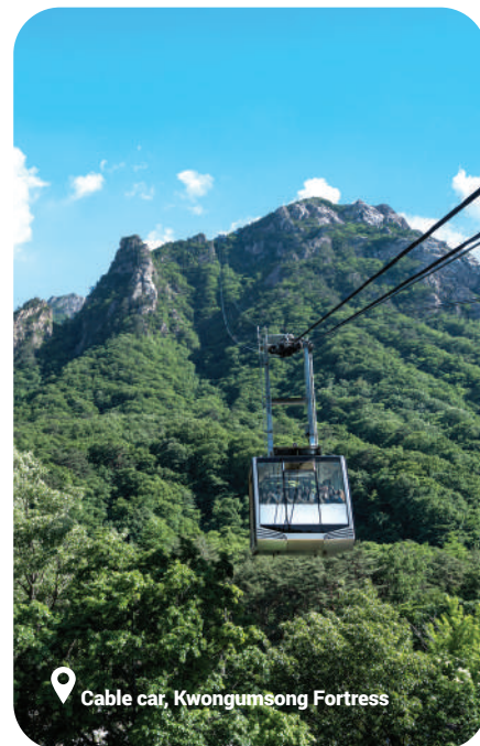
📍 Cable car, Kwongumsong Fortress