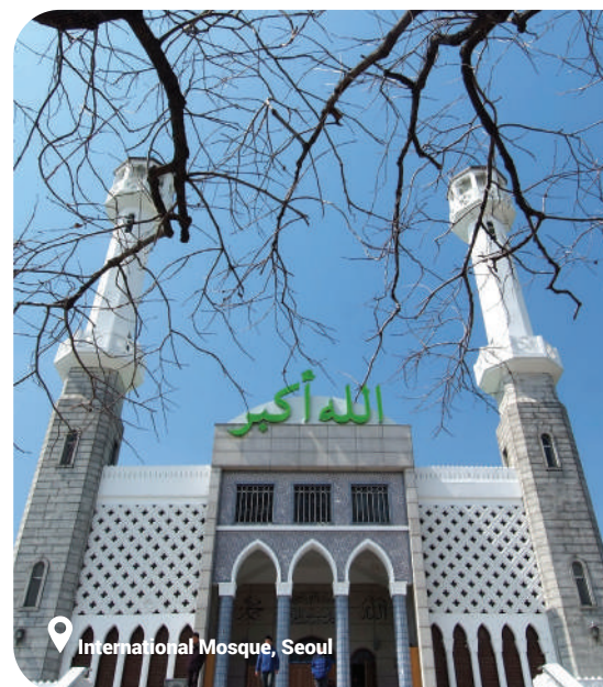
📍 International Mosque, Seoul