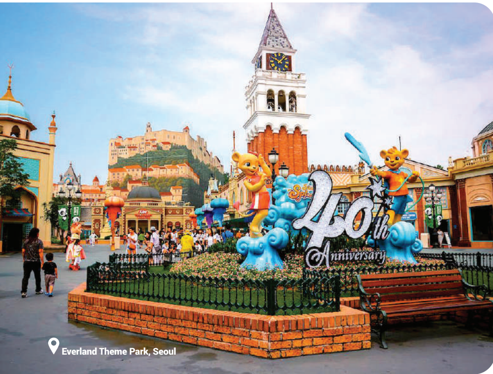
Everland Theme Park, Seoul