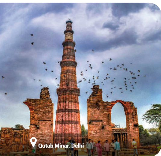
Qutab Minar, Delhi