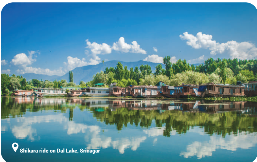
Shikara ride on Dal Lake, Srinagar