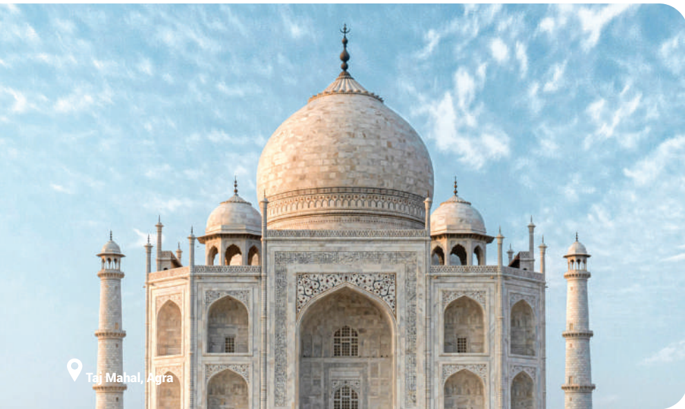
Taj Mahal, Agra