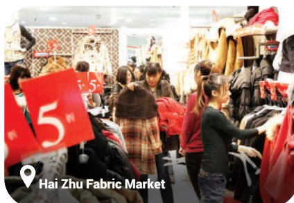
Hai Zhu Fabric Market