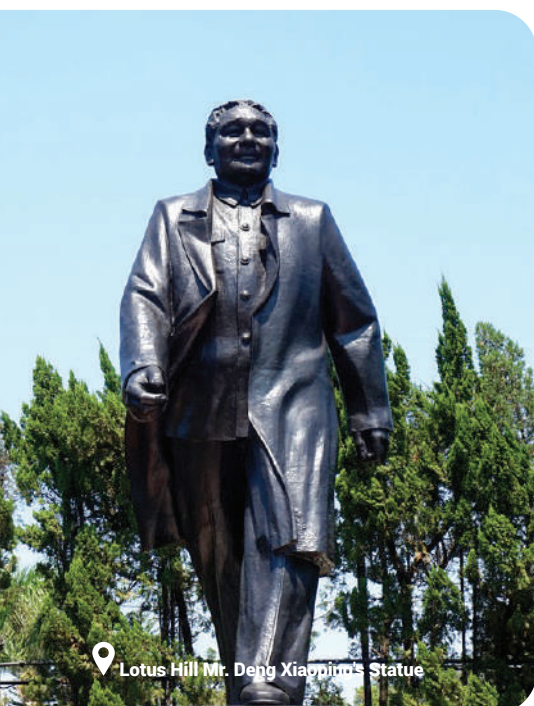
Lotus Hill Mr. Deng Xiaoping's Statue