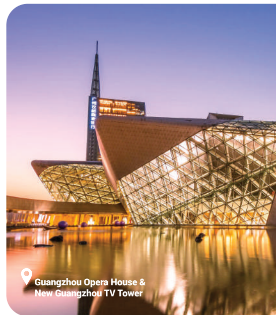
Guangzhou Opera House & New Guangzhou TV Tower