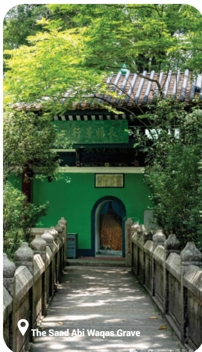
The Saad Abi Waqas Grave