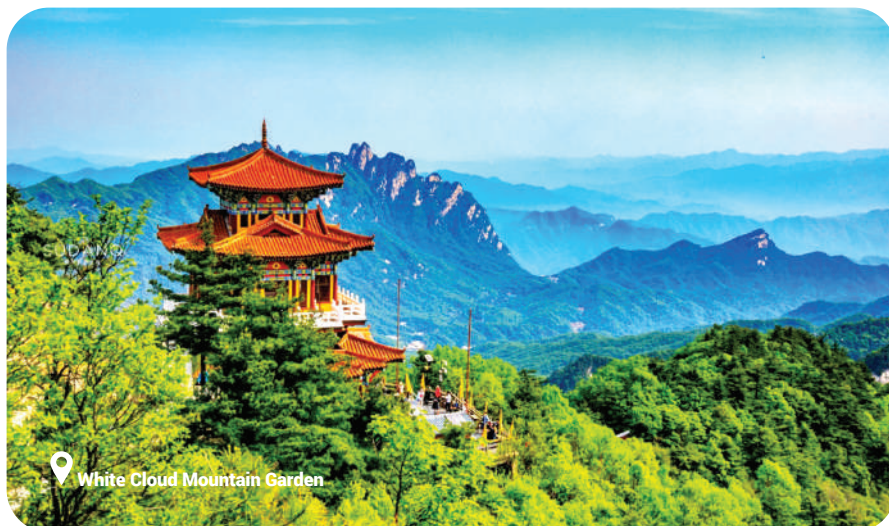
White Cloud Mountain Garden