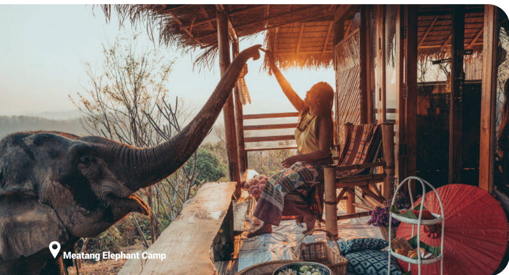
Meatang Elephant Camp