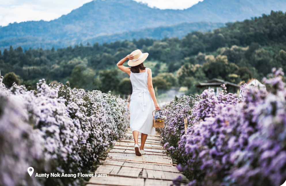
Aunty Nok Aeang Flower Farm