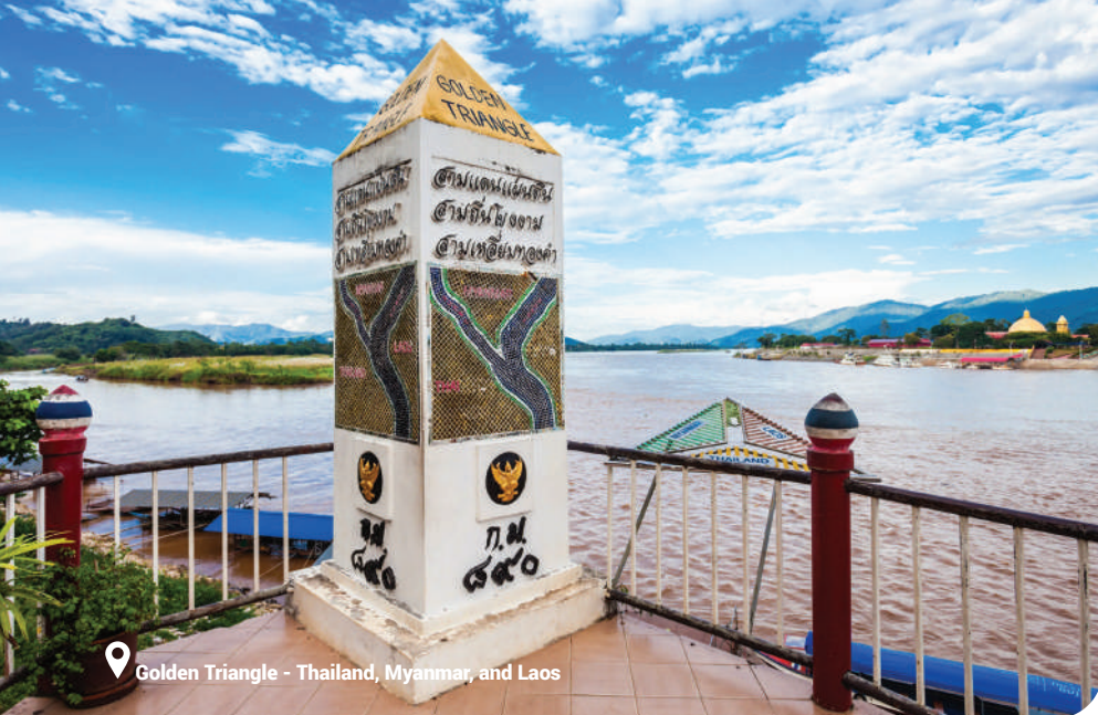
Golden Triangle - Thailand, Myanmar, and Laos