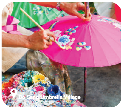
Bo Sang Umbrella Village