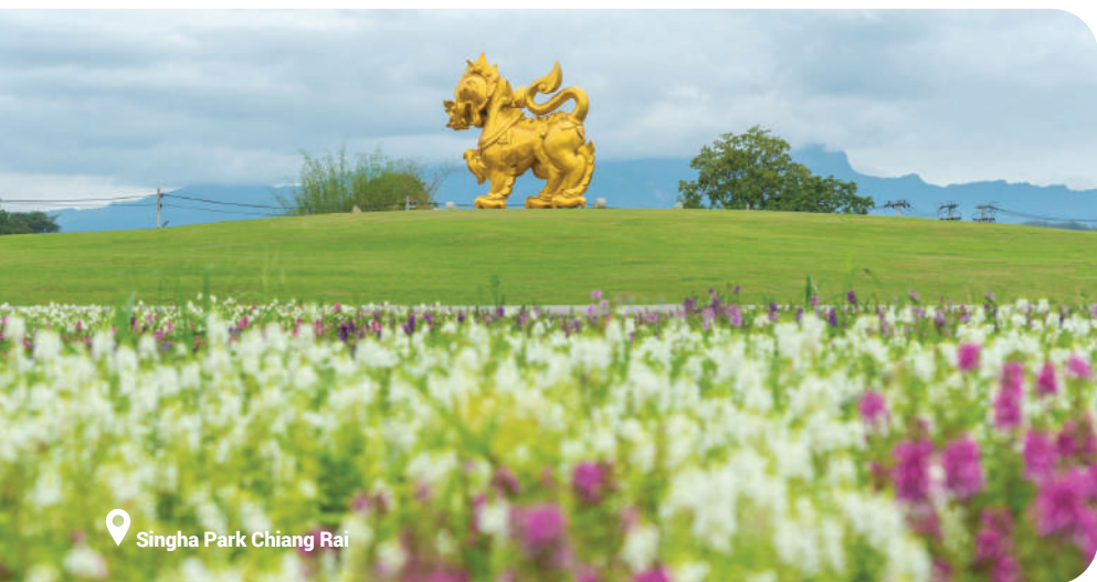
Singha Park Chiang Rai