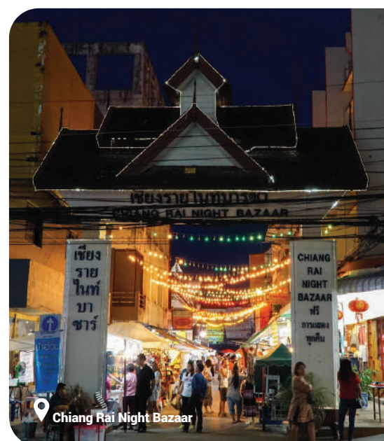
Chiang Rai Night Bazaar

Muslims pray at Mosques or Restaurants Pray'room.