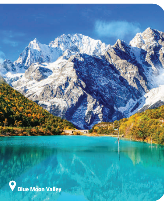
Blue Moon Valley