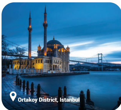
Ortakoy District, Istanbul