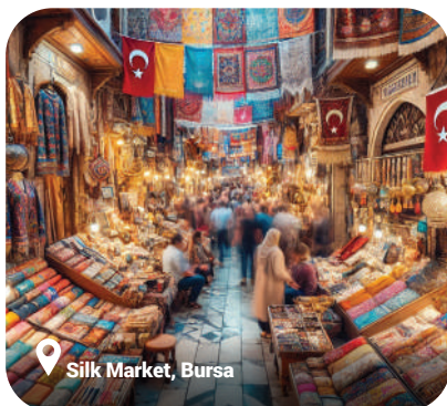
Silk Market, Bursa