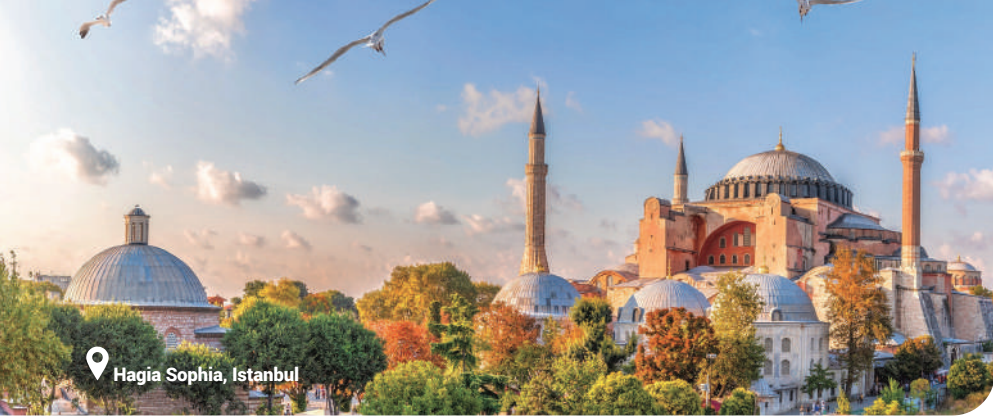
Hagia Sophia, Istanbul