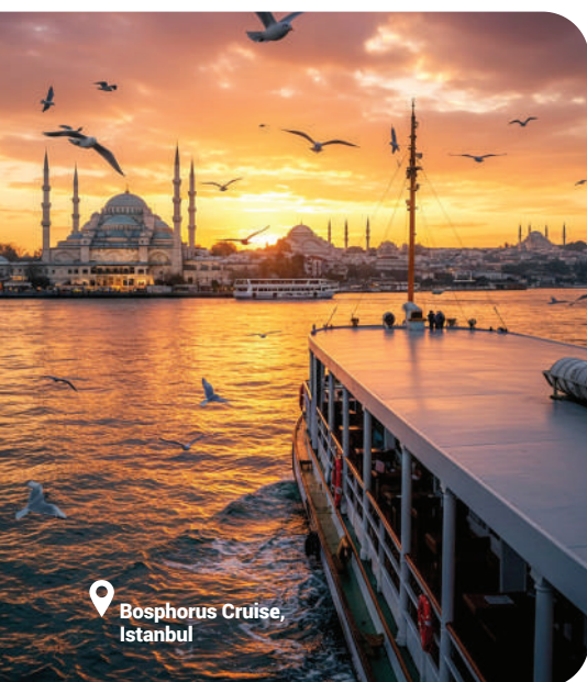
Bosphorus Cruise, Istanbul