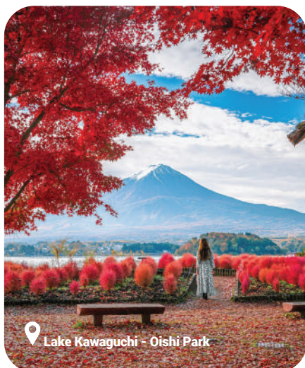
Lake Kawaguchi - Oishi Park