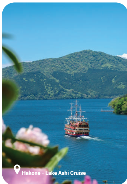
Hakone - Lake Ashi Cruise