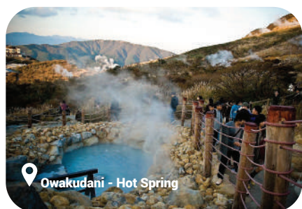
Owakudani - Hot Spring