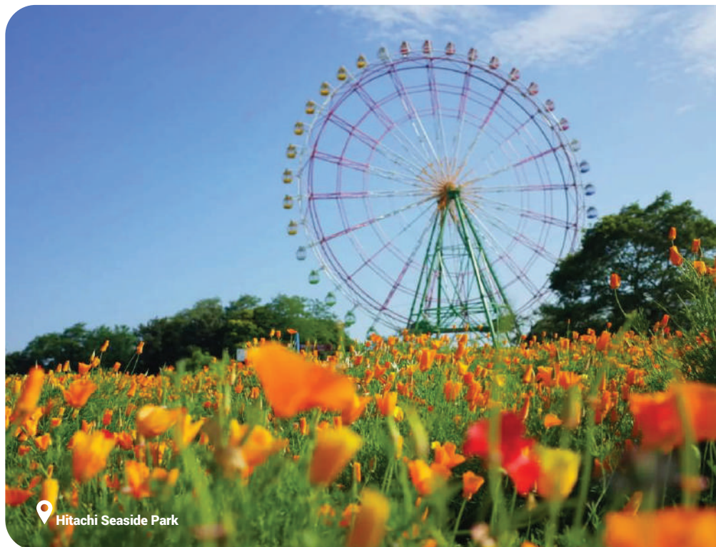
Hitachi Seaside Park