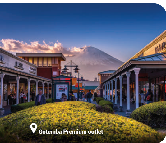
Gotemba Premium outlet