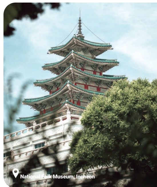
📍 National Folk Museum, Incheon