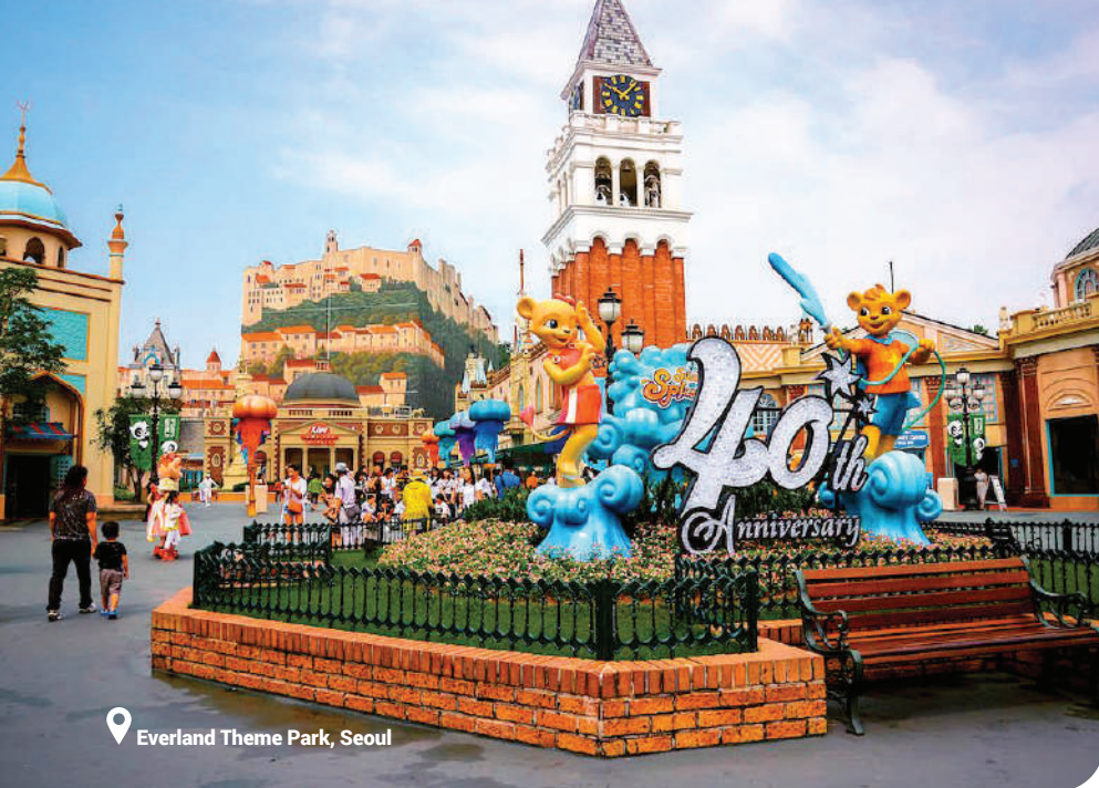
Everland Theme Park, Seoul