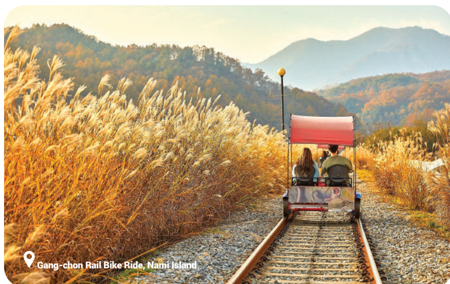
📍 Gangchon Rail Bike Ride, Nami Island