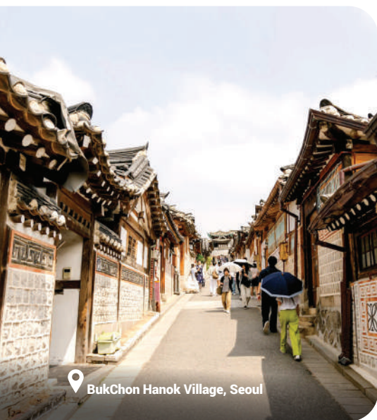
BukChon Hanok Village, Seoul