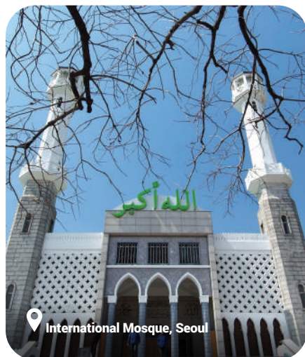
📍 International Mosque, Seoul