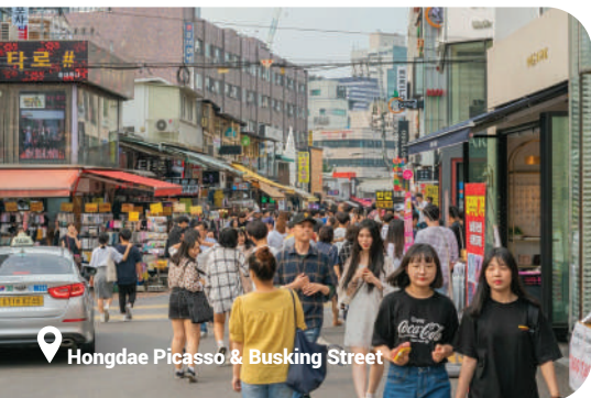
Hongdae Picasso & Busking Street