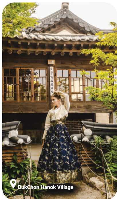
BukChon Hanok Village