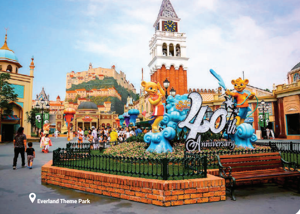
Everland Theme Park