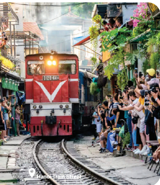
Hanoi Train Street