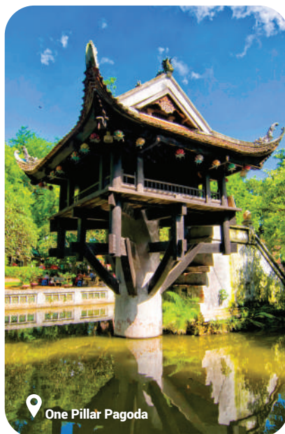
One Pillar Pagoda