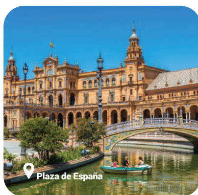
Plaza de España