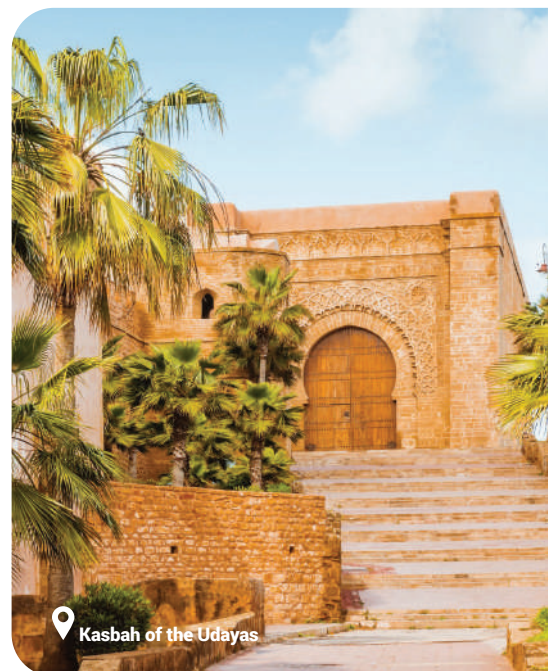
Kasbah of the Udayas