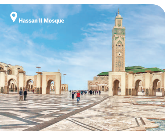
Hassan II Mosque