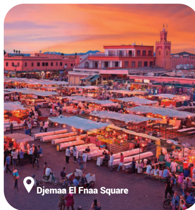
Djemaa El Fnaa Square