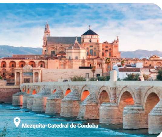
Mezquita-Catedral de Córdoba

Optional : Mosque Cathedral Monumental Site of Cordoba - EUR13pp