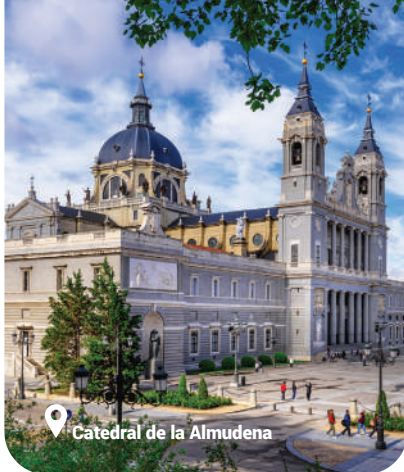
Catedral de la Almudena