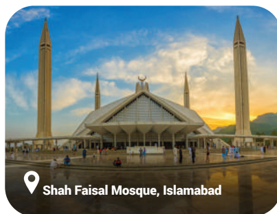
Shah Faisal Mosque, Islamabad