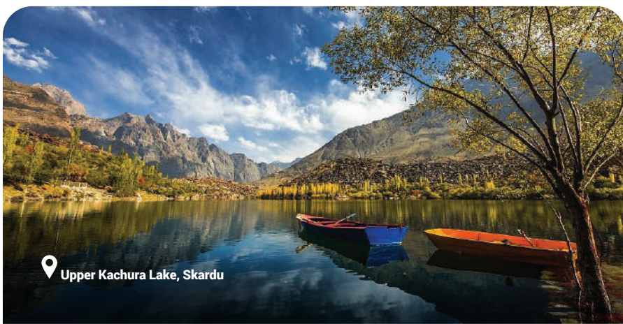
Upper Kachura Lake, Skardu