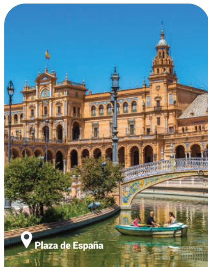
Plaza de España

Optional: Mosque-Cathedral Monumental Site of Córdoba EUR 13 per Adult.