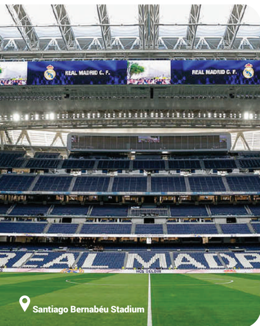
Santiago Bernabéu Stadium

Photo-stops; [Toledo] Plaza de Zocodover , Alcázar de Toledo , Toledo Cathedral , Ayuntamiento de Toledo , Jewish Quarter , Mezquita del Cristo de la Luz