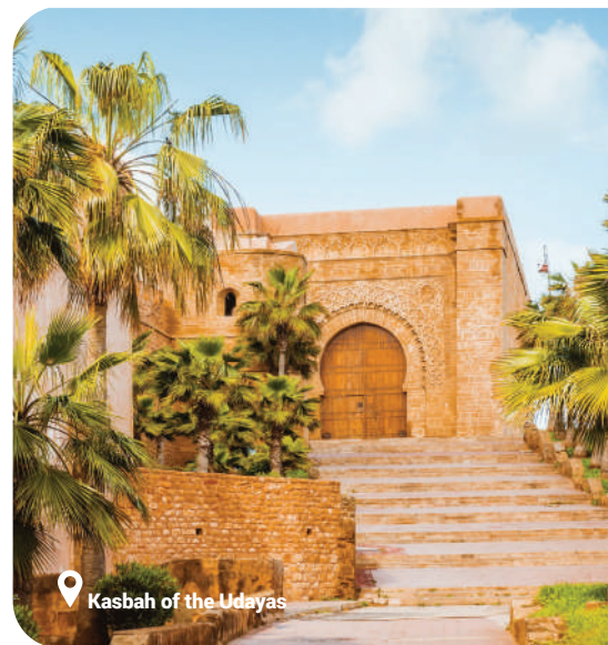
Kasbah of the Udayas

Photo-stop; Chefchaouen; Main Square, Kasbah, Central Mosque, Jewish Quater