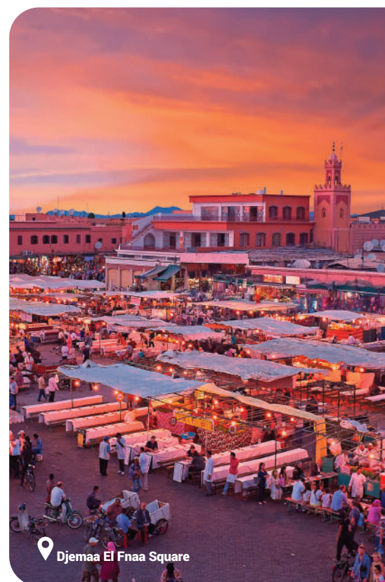
Djemaa El Fnaa Square