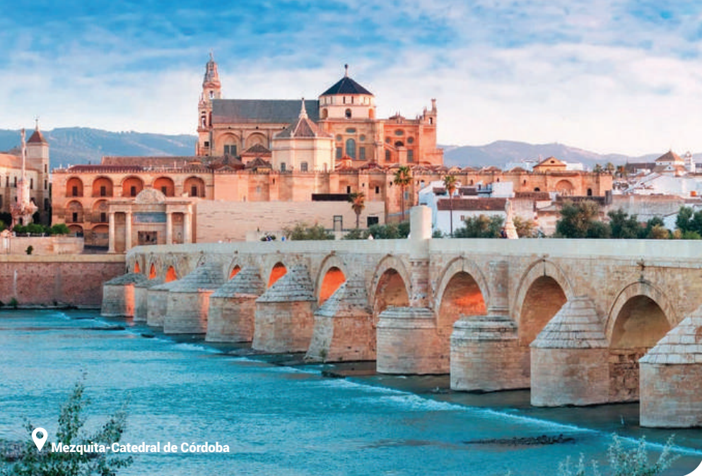
Mezquita-Catedral de Córdoba