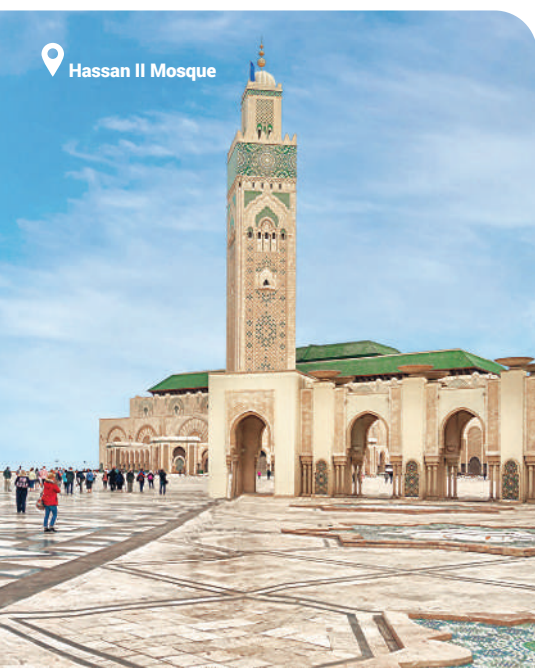
Hassan II Mosque

Photo-stop; Marrakesh; Koutoubia Mosque, Saadian Tombs, Bahia Palace