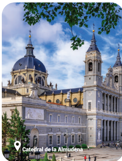
Catedral de la Almudena