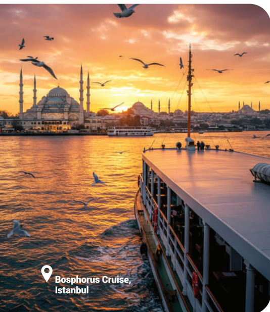
Bosphorus Cruise, Istanbul