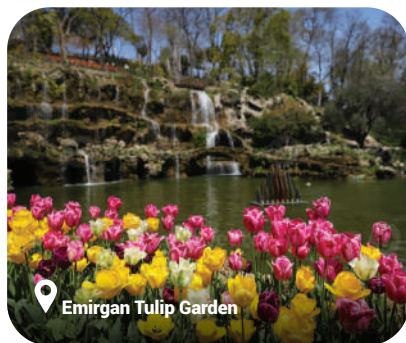
Emirgan Tulip Garden