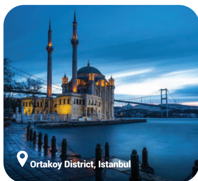
Ortakoy District, Istanbul