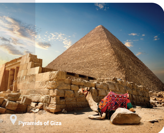
Pyramids of Giza