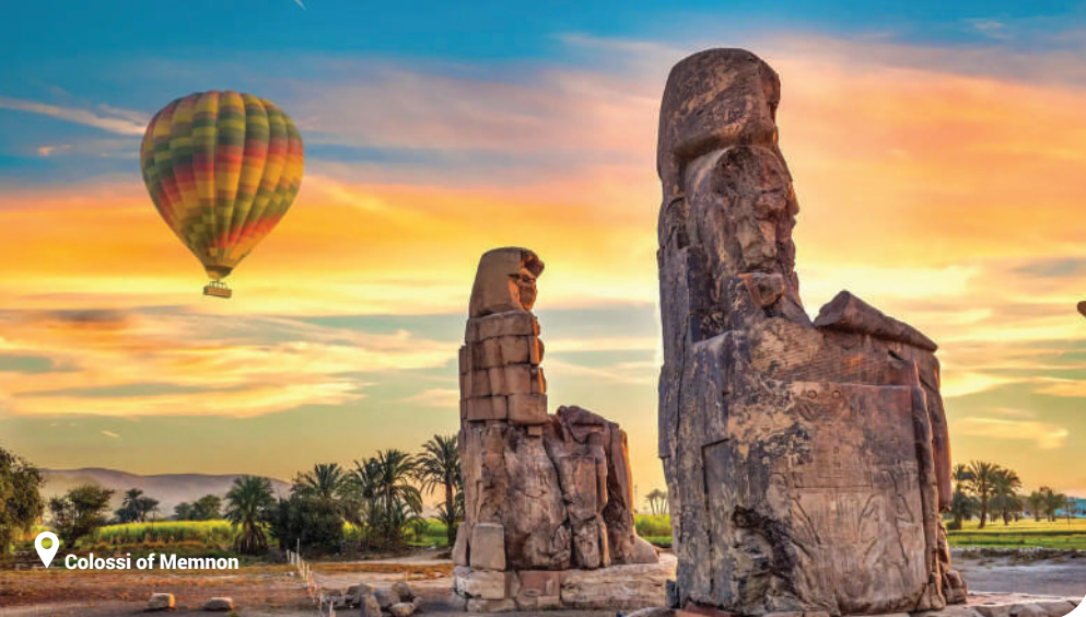
Colossi of Memnon