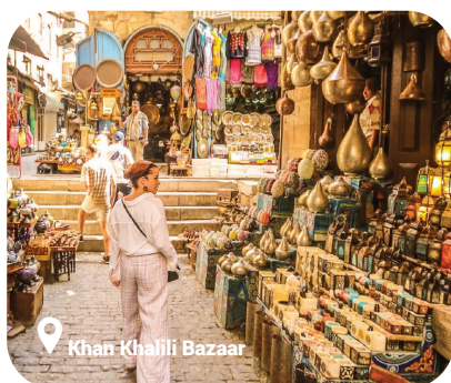
Khan Khalili Bazaar

Notes: The itinerary may be subject to change due to unforeseen circumstances and without prior notice.