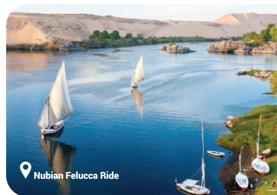
Nubian Felucca Ride